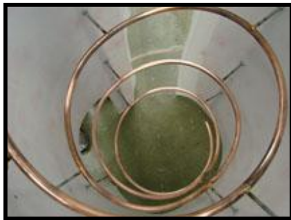
Copper tubing attached to the Lexan cylinder