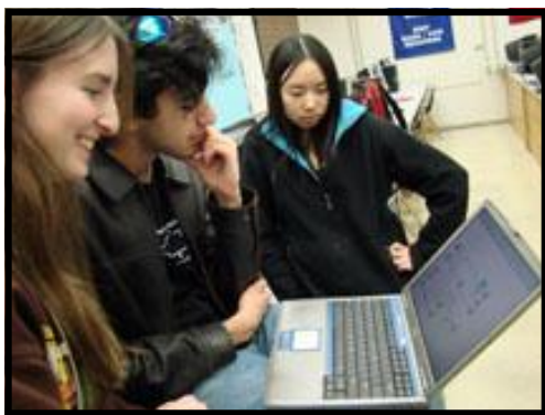
Programming team working hard with LabVIEW

This week in programming, we worked on the calculations for predicting the robot position. I was sad that we did not get the robot all week because the build team was working on the hopper. We used the robot for one day at the very end of the week to find out that electrical put the modules in the wrong places, a problem that took an hour to fix. Also, LabVIEW is very unforgiving when deploying code (apparently, you need to restart the computer).