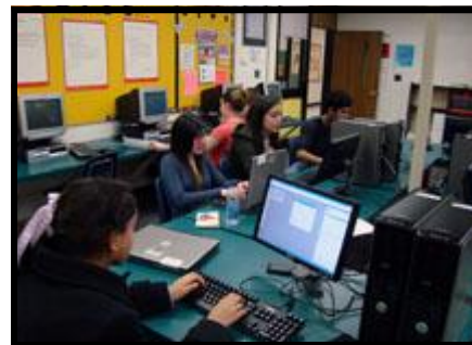
The PR team working on finishing the website