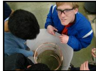
Members working on positioning the copper tube