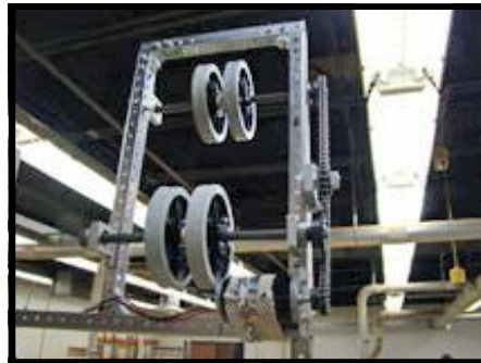
The shooter attached to the robot