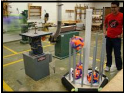
The shooter being tested

The build season will soon come to an end, and it still surprises me how fast it goes. With that in mind, it is important to be as efficient as possible when building a robot in such a time constraint as the one given to us by FIRST every year. When I came back to the team for the first time since I graduated last year, I saw a lot of changes. The membership grew to 60 total students and two new halls had been made so I was quite surprised. I didn't know how many new members would stay but I figured that most would get bored and leave before build season began in January. Well, I was wrong. Before build season even started, there were dedicated new members taking in everything they were exposed to. As the build season began I saw that the new kids were just as eager to work as the veterans and even the parents surprised me as they helped out as much as they could too. The robot is coming together and everyone is working hard. I'm glad I came back as a mentor, I would have missed all of this.